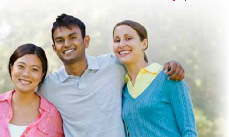
Single-Site™ da Vinci Surgery